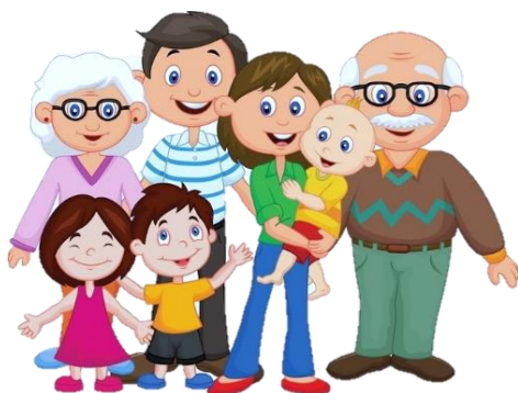
Families & Community

The Board of Governors has overall responsibility for the managing and functioning of the school. The Governors meet regularly and take an active interest in and support the work of the school.