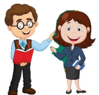
Staff & Governors